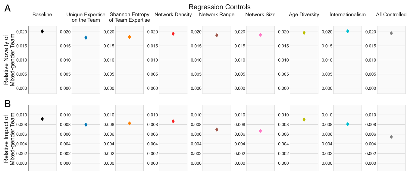
Fig. 3. Mixed-gender teams and research outcomes controlling for numerous factors. (A and B) The regression coefficient and 95% CIs for mixed-gender teams in predicting novelty (A) and citation impact (B) while controlling for the features indicated in the panel headings. The leftmost panels indicate the coefficients of mixed-gender team in baseline regressions. The rightmost panels indicate the coefficients of mixed-gender team after controlling collectively for expertise diversity, network structure, career age diversity, and international diversity.